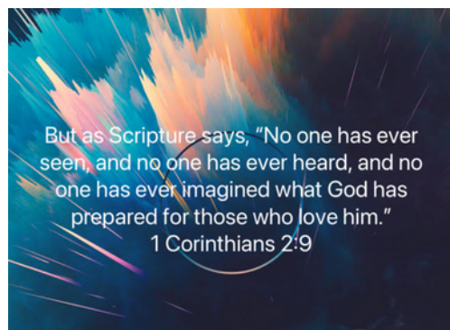
Scripture graphic created by YouVersion Bible App